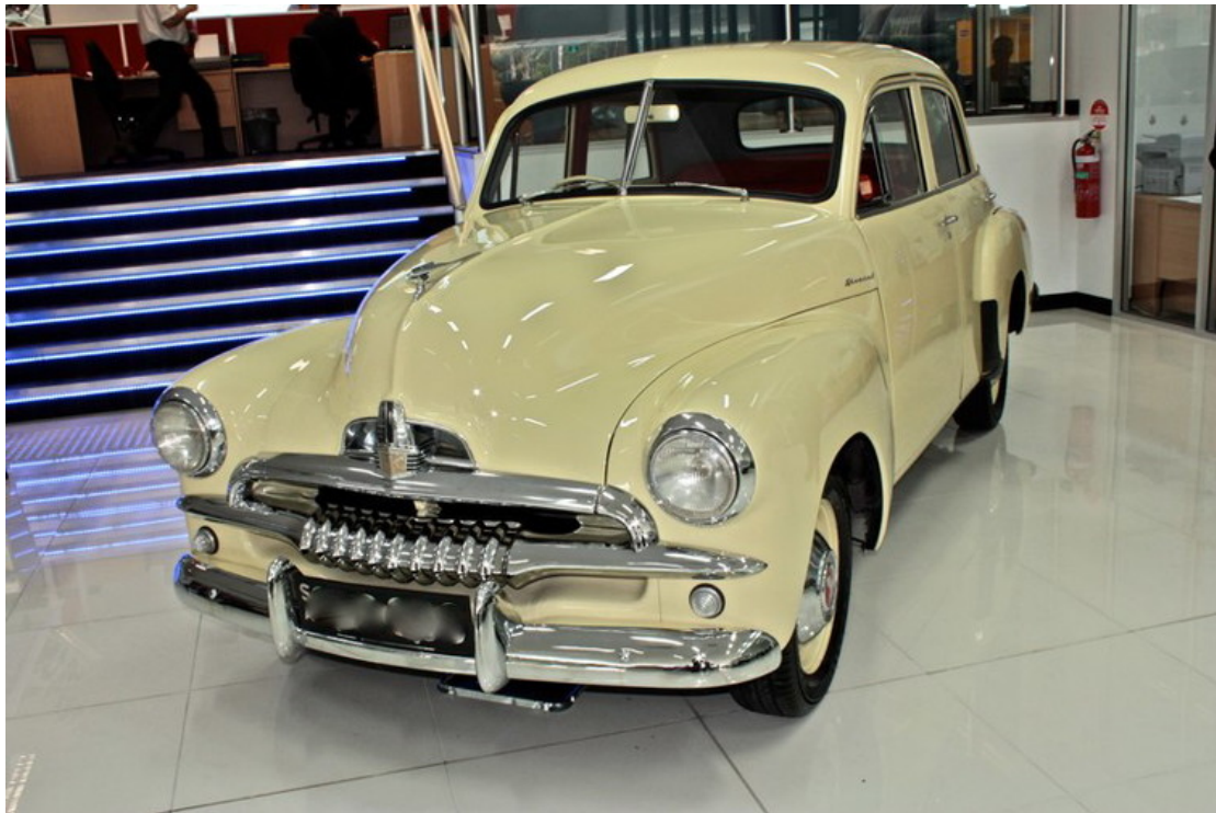
A Holden FJ series sedan, one of a range of vehicles produced in Australia by Holden from 1953 to 1957.

Those who grew up in Australia's endless suburbs in the 1950s and 60s remember the Holden as the car we all yearned for. Primary school children as well as adults became instant experts on the different models as they rolled off the assembly lines – the FJ, Holden Special, Monaro, Kingswood.